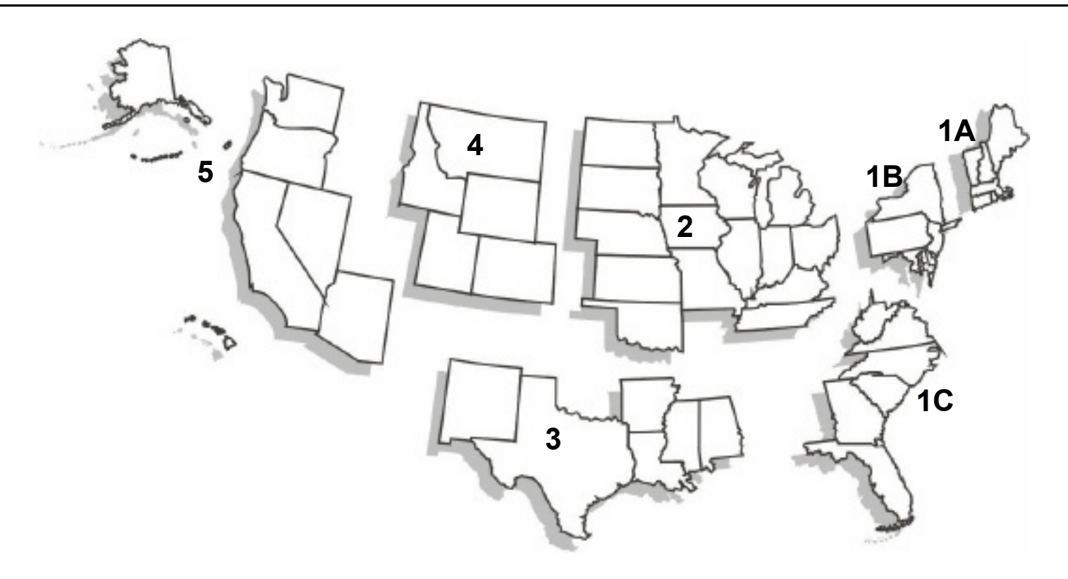
Figure TN3. Petroleum Administration for Defense districts and subdistricts