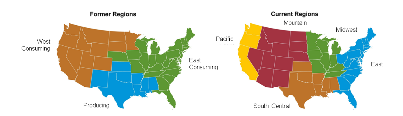
Figure 1: Former and new storage regions

EIA's Weekly Natural Gas Storage Report (WNGSR) publishes weekly natural gas storage inventories by region. To better capture regional storage trends and changing geographic dynamics of natural gas markets, EIA recently began publishing weekly data for five regions, rather than the previous three (Figure 1). Weekly historical data going back to 2010 are also available for the new five regions, and data for the former three regions were discontinued as of November 6, 2015.